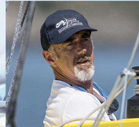
Loïck Peyron Happy

LES PLUS GRANDS SKIPPERS L'ONT DÉJÀ ADOPTÉ.